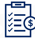
Financial close and cash on delivery