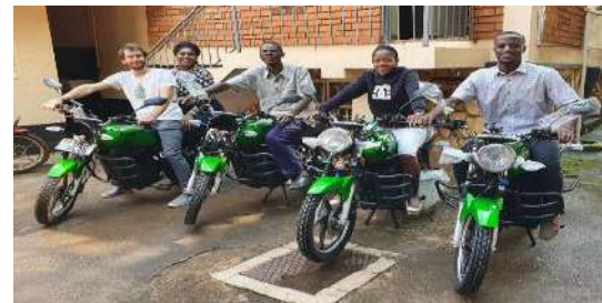
Electric bikes and solar charging infrastructure