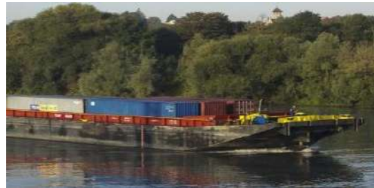
River transportation and inland terminal