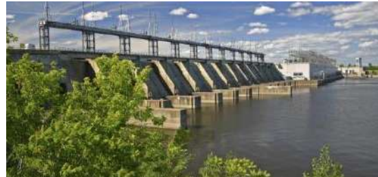
Portfolio of run-of-river hydro projects