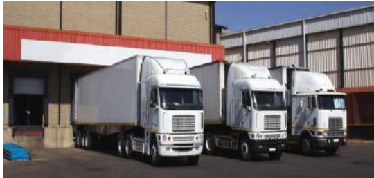
Inland storage and distribution facility