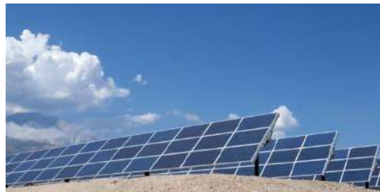
Grid-connected solar PV